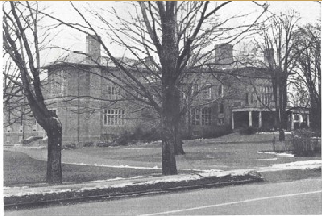
HOME OF THE ROCHESTER ACADEMY OF MEDICINE 1938

On January 28, 1938 The Lyon Daughters gave their home to The Rochester Academy of Medicine. In 1939 the Academy moved into the greatly expanded Lyon home on 1441 East Ave.